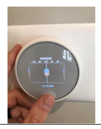
Example of a Scheduled Temperature Event on Monday at 12:00