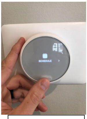
Schedule Task under Settings

check and remove schedule, press the Nest logo on the front of the thermostat. Select Settings on the main screen and then choose Schedule . Scroll through the days/times and select any schedule by pressing on the nest logo, then change or remove any scheduled temperature event.