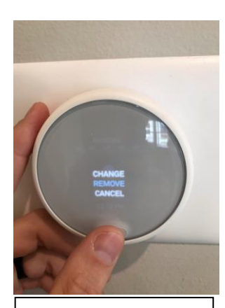
Remove Schedule Temperature Event