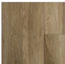
Joyful Fawn PARENT: TR906CW05 NVR: RK9CW005E