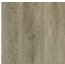
Beach Casual PARENT: BRPR91RK04EC NVR: RK9PR004EC