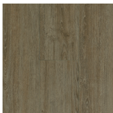
Shady Cove PARENT: BRLP70RK09E NVR: RK7LP009EC