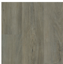
Breezy Home PARENT: RKAS96L11E NVR: RK9AS011E