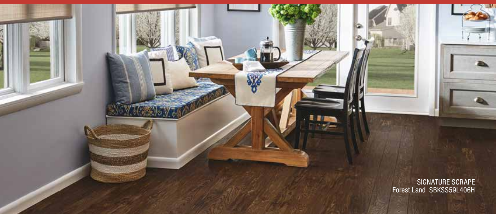
SIGNATURE SCRAPE Forest Land SBKSS59L406H