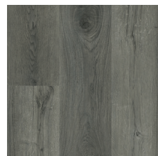
Reclaimed Oak PARENT: TR906CW02 NVR: RK9CW002E