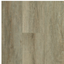
Timeless Charm PARENT: BRLR91RK07EC NVR: RK9LR007EC