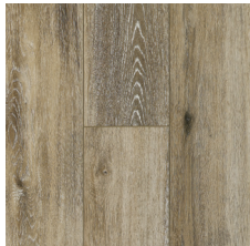
Design Oasis PARENT: BRPR91RK11E NVR: RK9PR011E