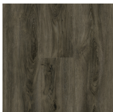
Chestnut PARENT: TR906CW03 NVR: RK9CW003E