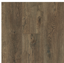
Down to Earth PARENT: BRLP70RK11E NVR: RK7LP011EC