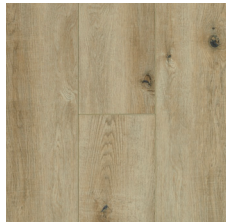
Must Have Tan PARENT: BRPR91RK02EC NVR: RK9PR002EC