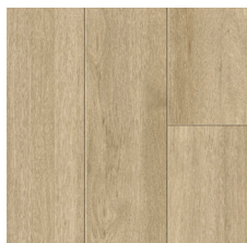
Sand Dune PARENT: TR906CW01 NVR: RK9CW001E