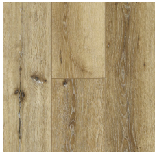
Prairie Blossom PARENT: BRPR91RK12E NVR: RK9PR012E