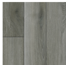
Sandalwood PARENT: TR906CW04 NVR: RK9CW004E