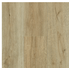
Beachside Warmth PARENT: EKEP70L02E NVR: RK7EP002EC