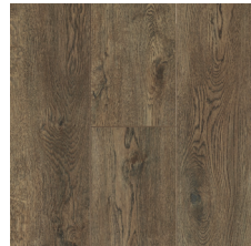
Walk in Woods PARENT: BRLR91RK05EC NVR: RK9LR005EC