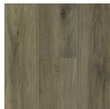
Coastal Setting PARENT: BRLP70RK10E NVR: RK7LP010EC