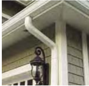
Rainware, Fascia, Soffit