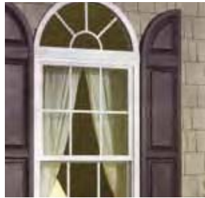
Shutters, Vents, Mounting Blocks